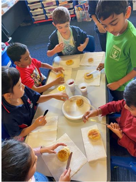
The day making Damper and art and crafts