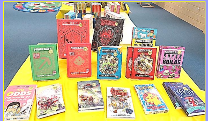
KINDY A and B